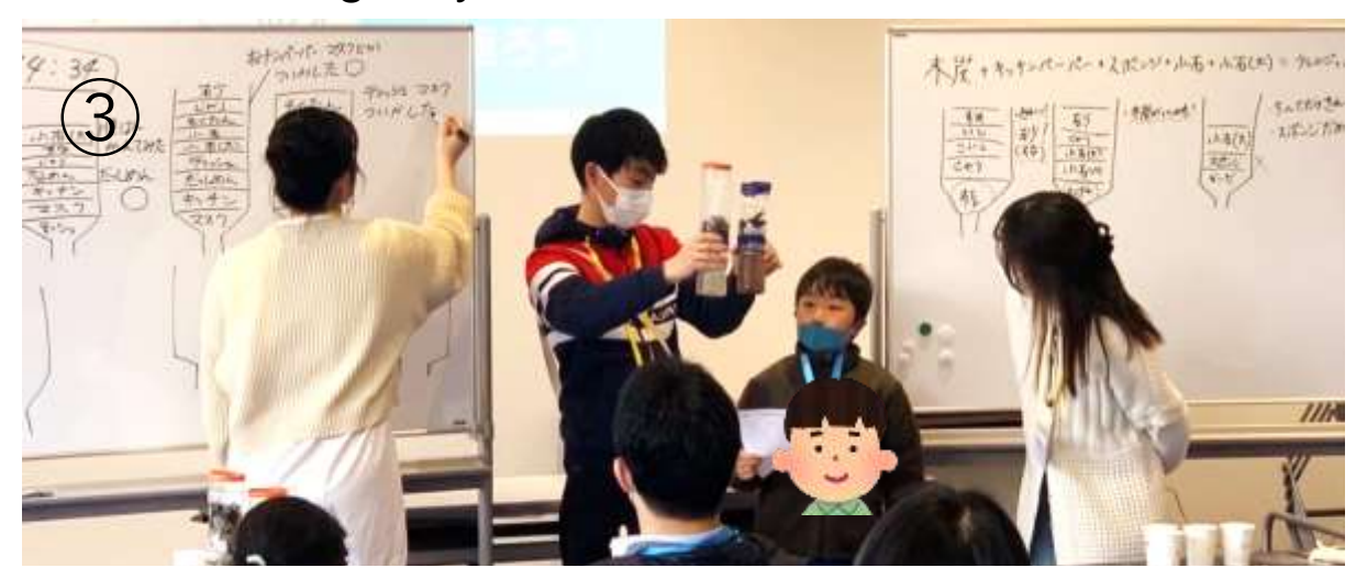
Presentation of their ideas