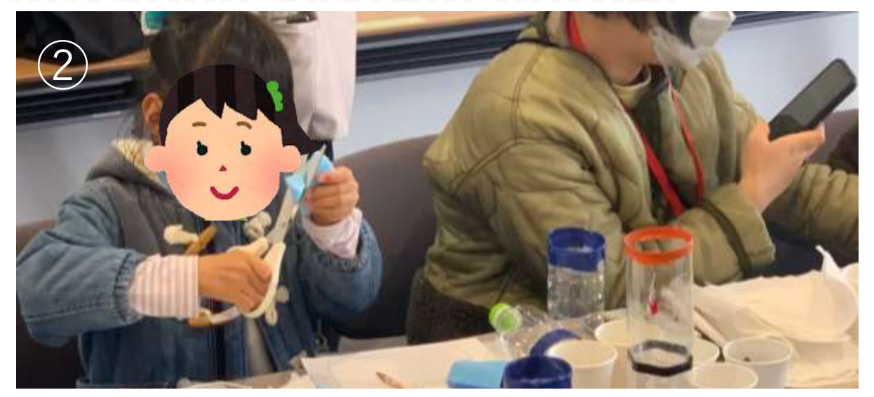
Trying to make the water clean