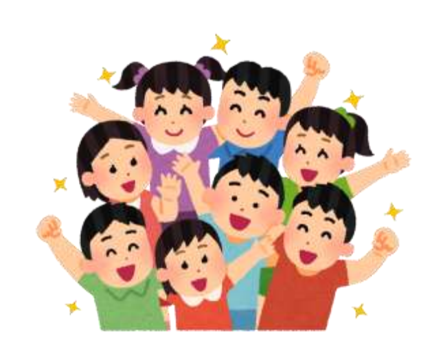
Children in the local area