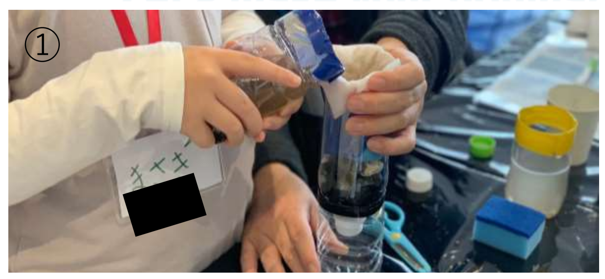
Pouring dirty water into the bottle he made