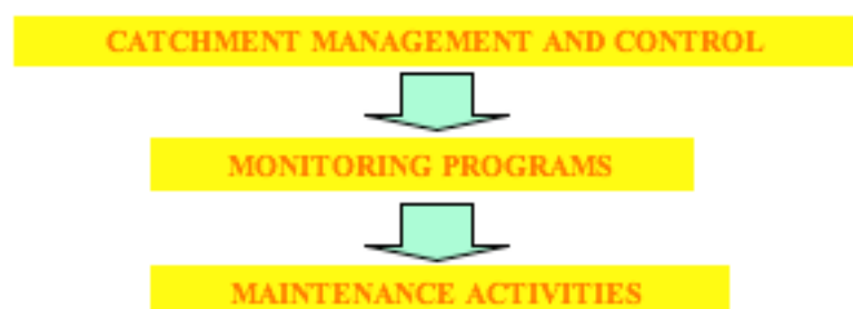
Figure 3: The three phases of wetland management elements

For the purpose of enhancing the wetland efficiency in stripping the extremely high phosphorus loading in Putrajaya Wetland, the catchment management mechanisms are formulated to monitor and ensure the discharge pollutant loading in the upstream region is limited to the desired level. Another measure that has been considered in the design is the formation of primary sedimentation basins or fore bays prior to entry to the wetlands.