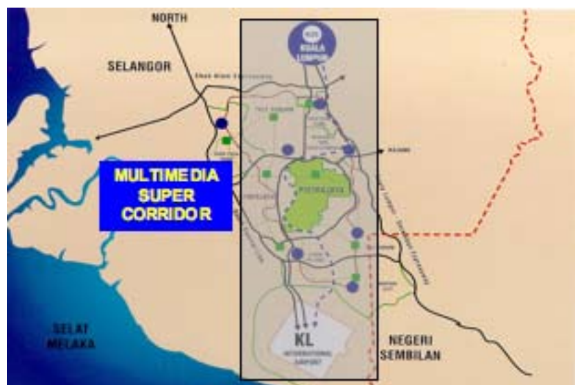
Figure 1: The location of Putrajaya within the Multimedia Super Corridor (MSC)

A number of important functionalism considerations were given serious thought even before the acceptance of Putrajaya Master Plan. There are two tasks in defining functionalism in architecture and urban design. The first involves an understanding of human motivations and needs, and the second, is more on the aspects of the processes to fulfill those needs that might possibly be