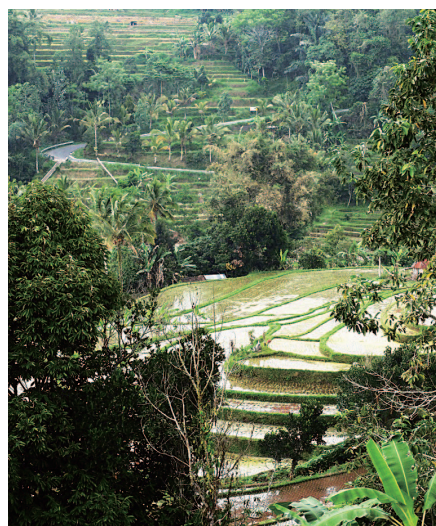
The Jatiluwih Rice Terrace, the UNESCO World Heritage Site

However, there are a few important lakes in this island; the most notable one is probably Lake Batur located in the north east region of Bali. This crater lake has a stunning panoramic view and is designated as one of the 15 Priority Lakes (to learn more, please read the featured article on the next page) under the conservation policy by the