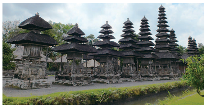
Taman Ayun Temple, the UNESCO World Heritage Site (Its canal supplies water to the neighbouring paddy fields, is rarely seen in other temples.)

Hosted in such attractive sites, this upcoming World Lake Conference will be the first one ever held in South East Asia in its 30 year history. Wide range of session and forum topics are expected, from global trends such as climate change and transboundary lake basin issues, to national/regional discussions of Indonesian and South East Asian lakes. We look forward to meeting our readers in Bali next year.